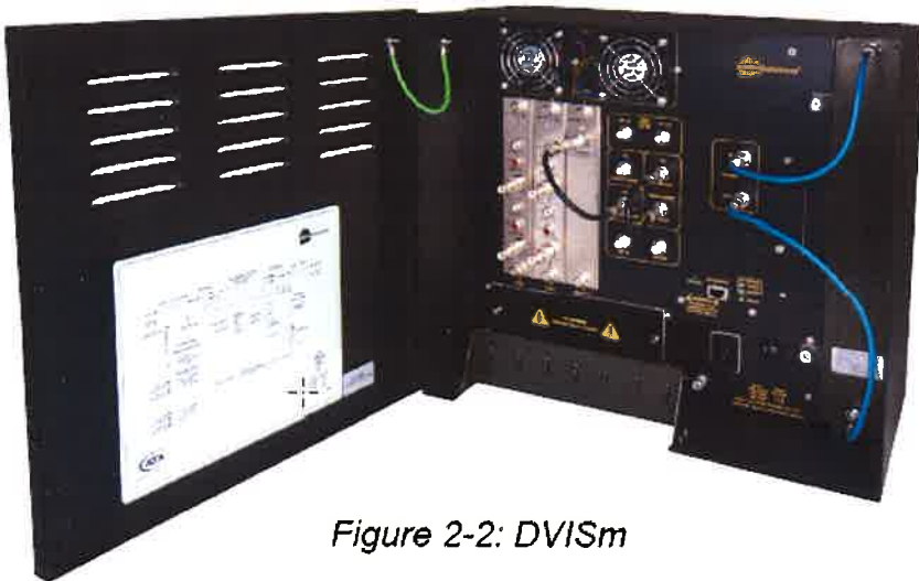
Figure 2-2: DVISm

DVISm 13.5"H x 14.5"W x 8.75"D (34.29H x 36.83W x 22.23D cm)